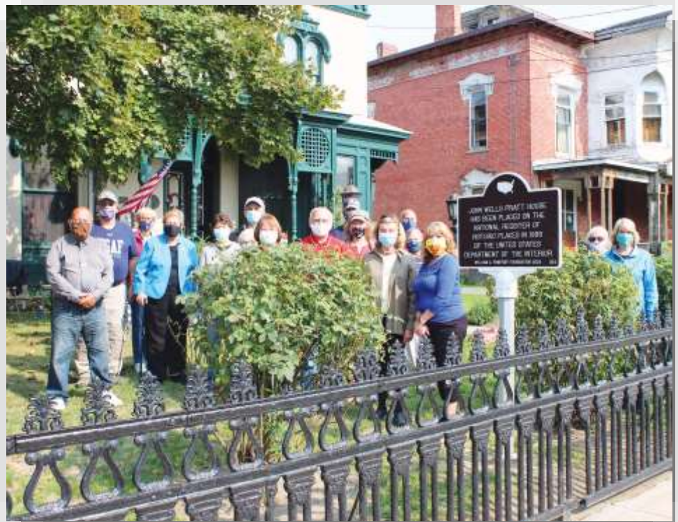
Joining the commemoration celebration were members of the Friends of History board as well as the Fulton Common Council and other friends of the museum.

This was a great day for the Pratt House Museum. The Friends of History in Fulton was and continues to be dedicated to preserving the history of Fulton and the surrounding areas.