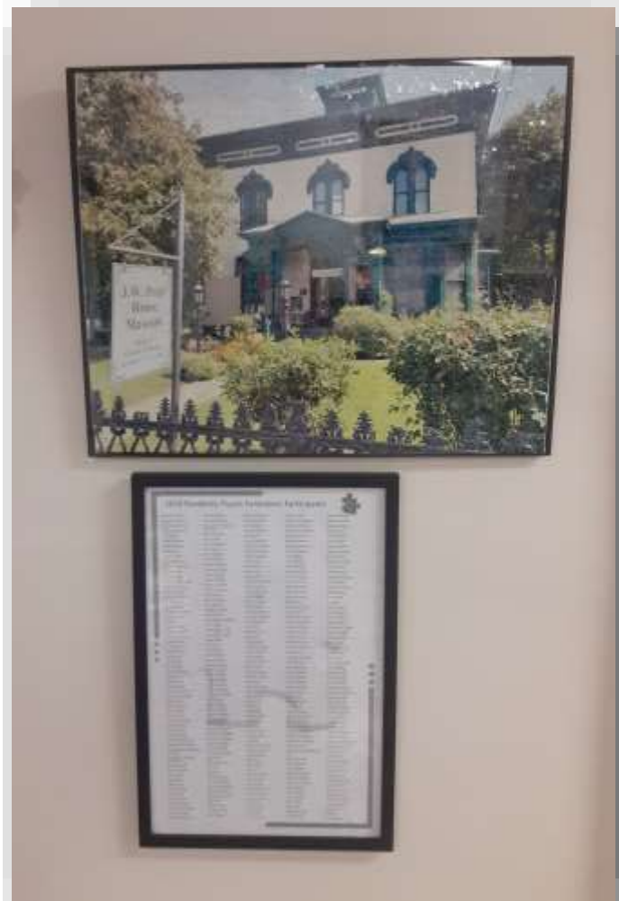
Pictured here is our Pandemic Puzzle Fundraiser completed with a list of all who participated framed beneath. It has been proudly mounted in the museum's office. We thank all who participated and sincerely appreciate your participation.